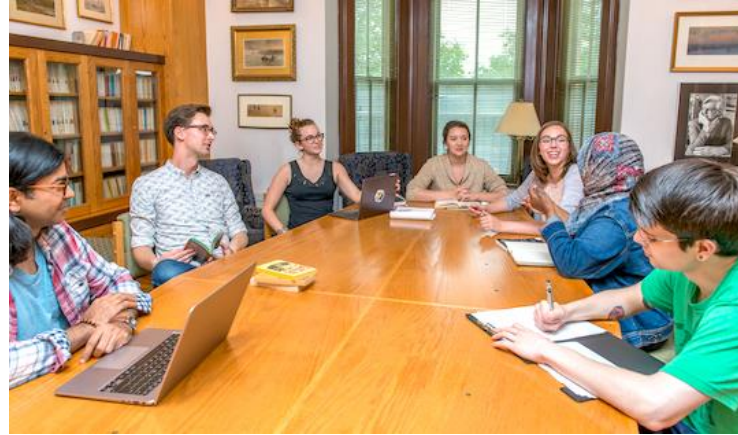
Seminar (SEM) or Workshop (WRK)